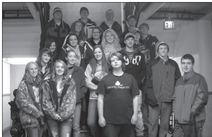
The Verndale psychology class toured the Fergus Falls State Hospital, enjoying its architecture and learning what it was like to be a patient.

The field trip was in correspondence with the class's abnormal psychology unit. Students were amazed at how