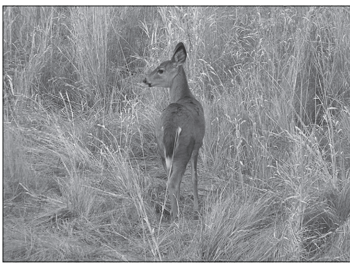
Oooh, the possibilities....